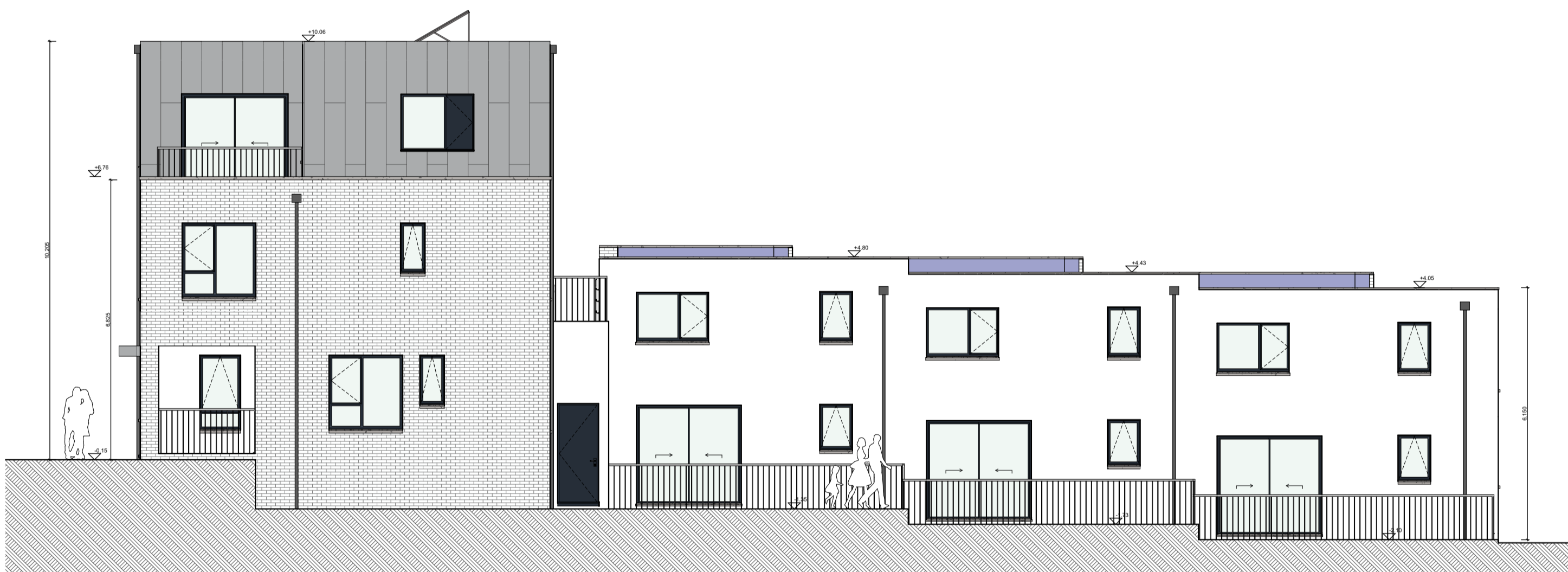
1:100 Communal Open Space Elevation