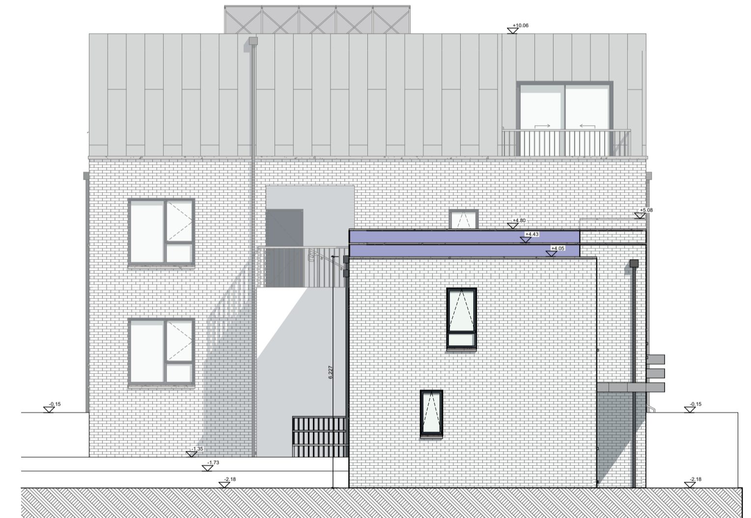
1:100 End Elevation