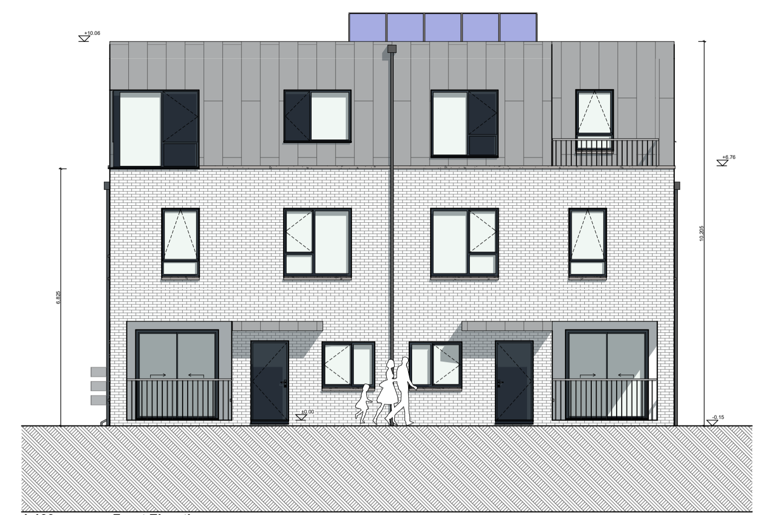
1:100 Front Elevation