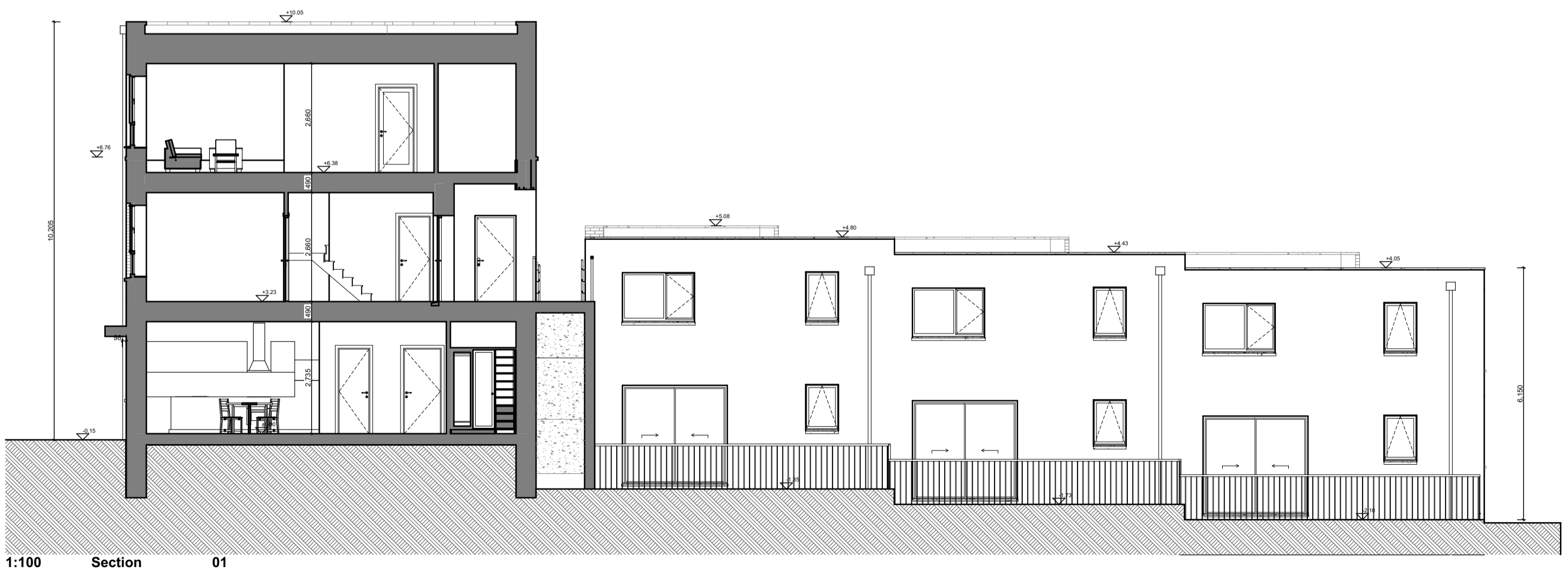
1:100 Section 01